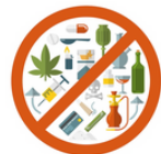
Substance Abuse Prevention