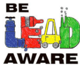
Lead Poisoning Prevention