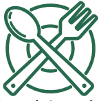
Food Service Inspections