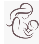
Breastfeeding Peer Counselor