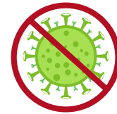
Communicable Disease Investigation