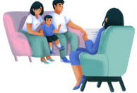
Family Case Management