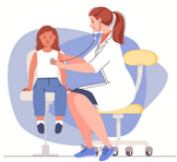
Well Child Physicals